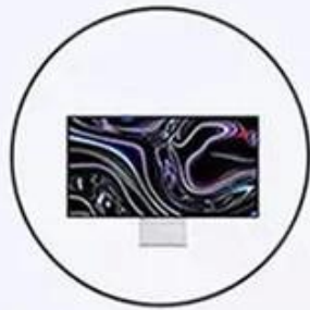
Pro Display XDR