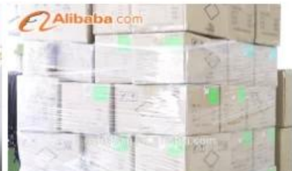
Packed and labeled for shipment