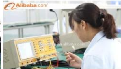
Testing after injection