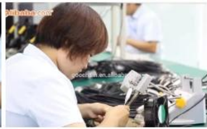
Semi-Automatic PET Bottle Blowing