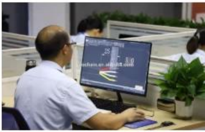
Product design and SOP making