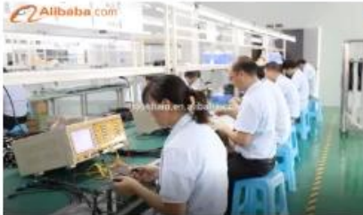
Testing before injection