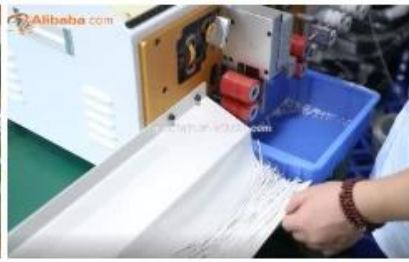
Automatic wire cutting and stripping