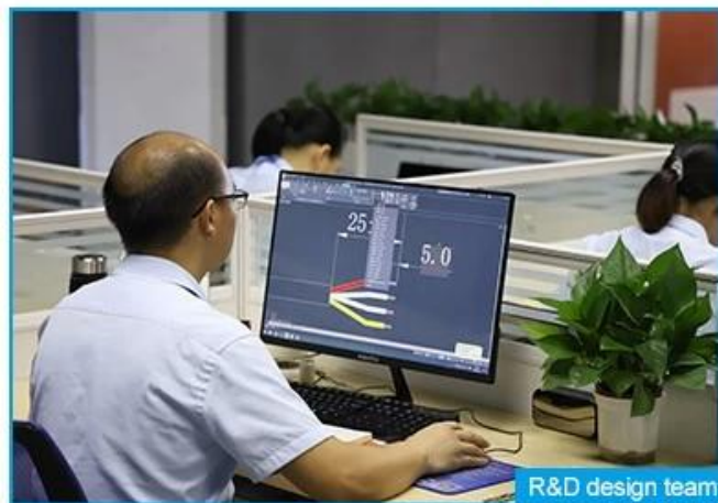
R&D design team