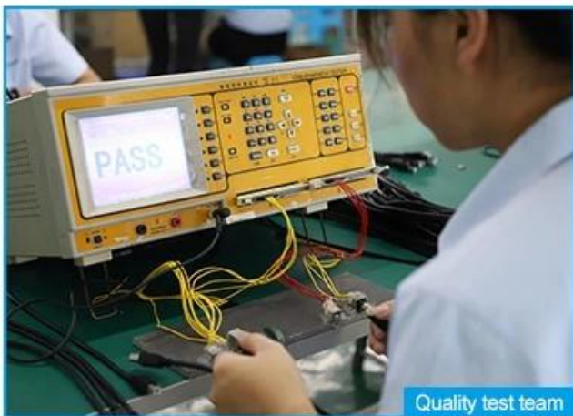
Quality test team