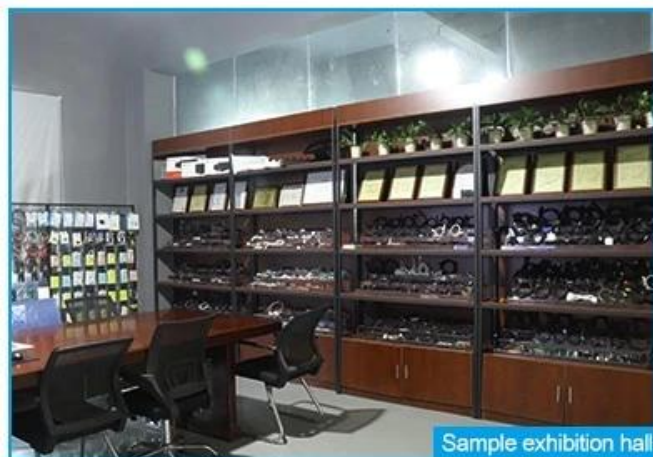
Sample exhibition hall