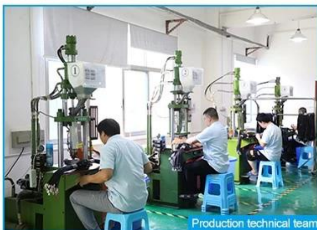
Production technical team