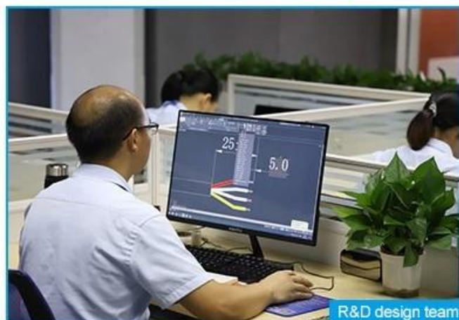
R&D design team