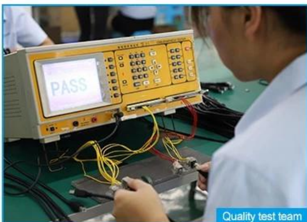
Quality test team