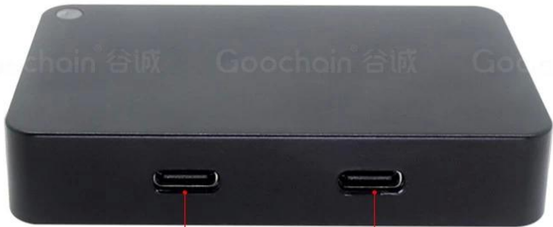
Accessory Charge & Data