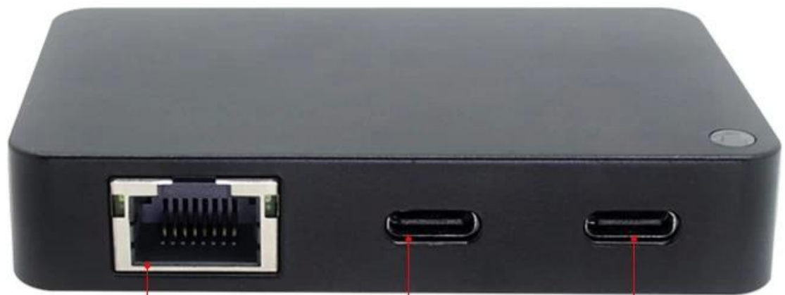
10W POE Charge