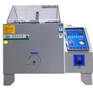
Salt Spray Machine