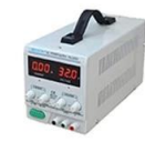
Automatic solder machine