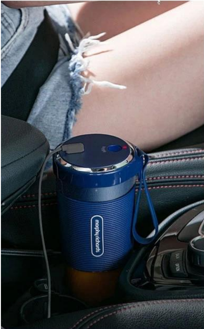
Magnetic smart watch charger Support charging in multiple scenarios